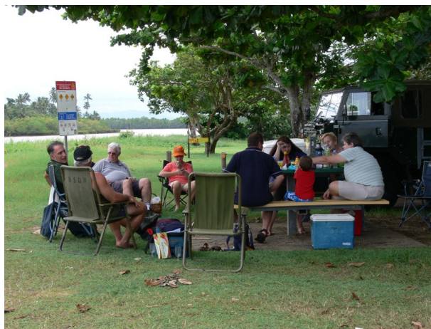
Bar B Que at The Coconuts in Innisfail

Any views expressed in this newsletter are not necessarily those of the LROCC Committee or Members