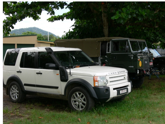
Variety is the spice of life!

After returning to the carpark we were soon off to the Garradunga Pub for some well earned refreshment.